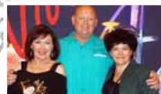
1st - Two Star Smooth