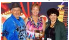
2nd - One Star Latin