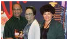
2nd - One Star Standard