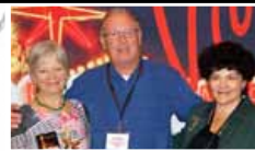
1st - Senior Rumba