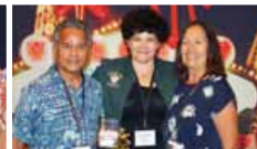
3rd - Senior Cha Cha