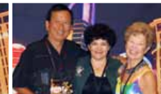
2nd - One Star Smooth