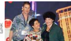
1st - One Star Smooth