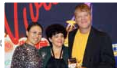
1st - One Star Rhythm