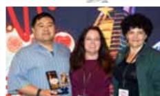
1st - Two Star Standard