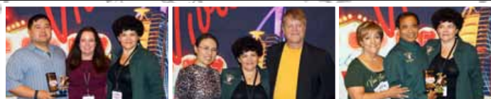
1st - Two Star Latin 2nd - Two Star Latin 3rd - Two Star Latin