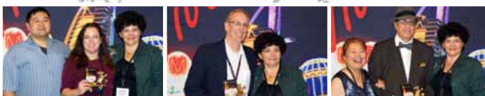
1st - Four Star Smooth 2nd - Four Star Smooth 3rd - Four Star Smooth