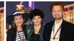
3rd - One Star Smooth