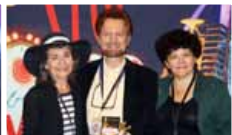
3rd - One Star Standard