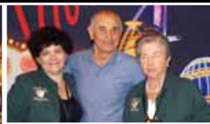
2nd - Senior Waltz