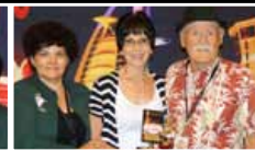
2nd - Senior Rumba