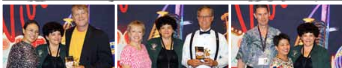
1st - Two Star Rhythm 2nd - Two Star Rhythm 3rd - Two Star Rhythm