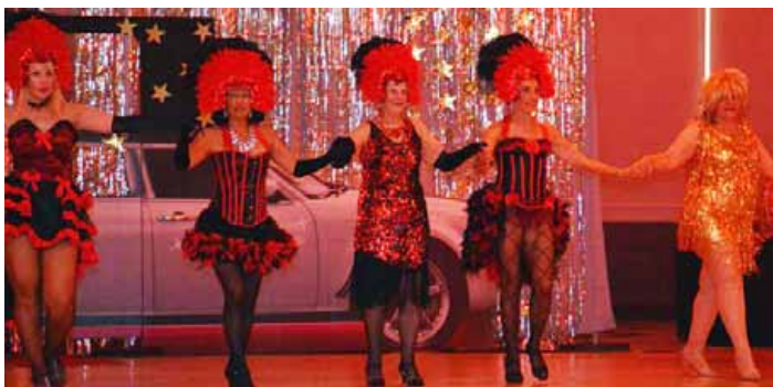
“Stars Come Out At Night” Opening Show