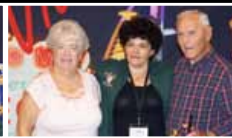
3rd - Senior Waltz