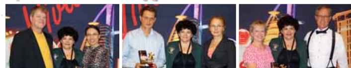
1st - Three Star Rhythm 2nd - Three Star Rhythm 3rd - Three Star Rhythm