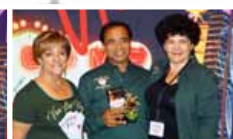
3rd - Two Star Standard