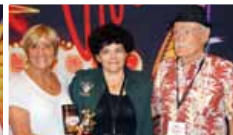
2nd - Senior Cha Cha