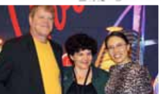
1st - One Star Latin