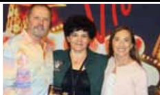
1st - Senior Waltz