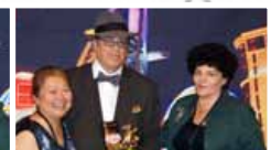
3rd - Two Star Smooth