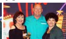
2nd - Two Star Standard