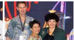
3rd - One Star Rhythm