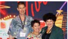
1st - One Star Standard