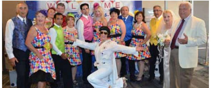
Golden Gate Formation Team

When it was time for the afternoon dance, everyone came dressed in their finest white attire as we headed to the “Chapel of Love”. It was wonderful to look around the room and see so many people dressed head to toe in white. Our own Formation Team kicked the afternoon off with an exhibition