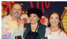
1st - Senior Cha Cha