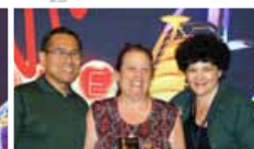
2nd - Two Star Smooth