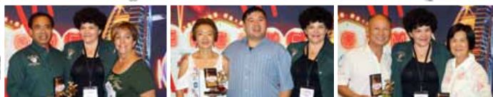
1st - Three Star Standard 2nd - Three Star Standard 3rd - Three Star Standard