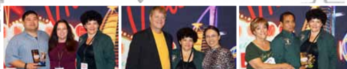
1st - Four Star Rhythm 2nd - Four Star Rhythm 3rd - Four Star Rhythm