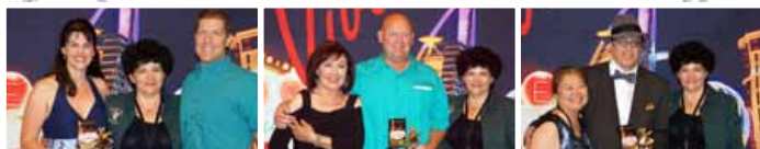
1st - Three Star Smooth 2nd - Three Star Smooth 3rd - Three Star Smooth