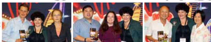
1st - Three Star Latin 2nd - Three Star Latin 3rd - Three Star Latin