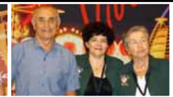
3rd - Senior Rumba