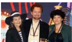
3rd - One Star Latin