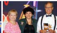
2nd - One Star Rhythm